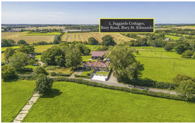
1, Jaggards Cottages, Bury Road, Bury St. Edmunds